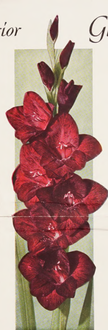
MOROCCO $1.25 for 10 $10.00 per 100